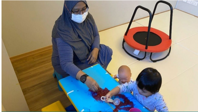
Early Start Program