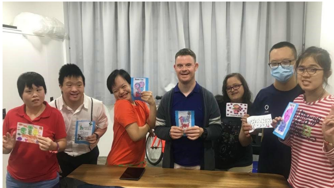
Independent Living and Training Centre