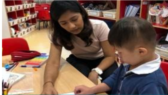
Integration Facilitation Support Program