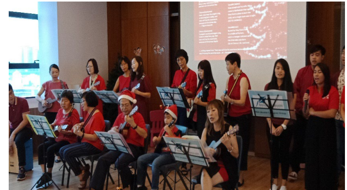
Family Support Services