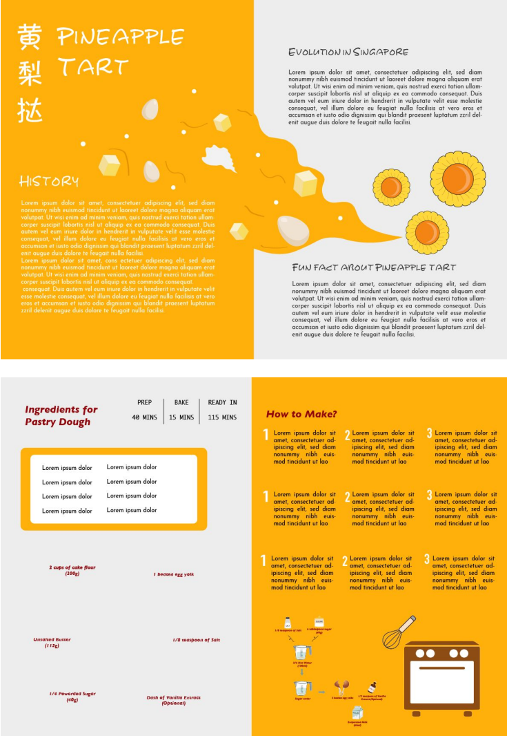
history evolution fun fact