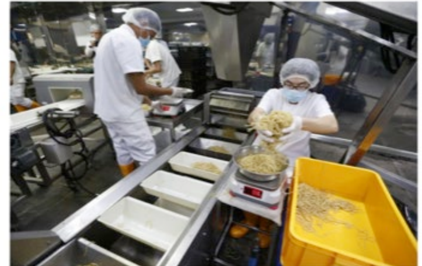
The new Singapore Food Agency will address all food-related issues, from food production to food hygiene.

New agency launched to strengthen food security and safety, from farm to fork